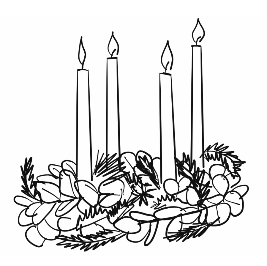
Fourth Sunday of Advent December 22, 2024

A Parish Church in the Episcopal Diocese of Atlanta established 1828