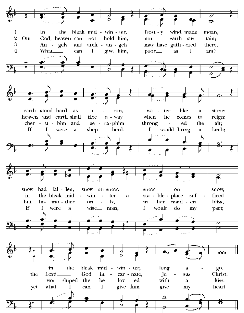
Hymn 112 Cranham